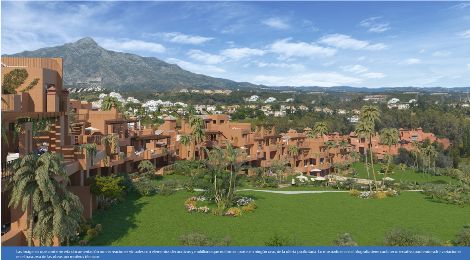
Las imágenes que contiene esta documentación son recreaciones virtuales con elementos decorativos y mobiliario que no forman parte, en ningún caso, de la oferta publicitada. Lo mostrado en esta infografía tiene carácter orientativo pudiendo sufrir variaciones en el transcurso de las obras por motivos técnicos.