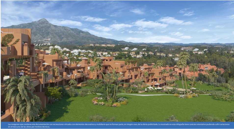
Las imágenes que contiene esta documentación son recreaciones virtuales con elementos decorativos y mobiliario que no forman parte, en ningún caso, de la oferta publicitada. Lo mostrado en esta infografía tiene carácter orientativo pudiendo sufrir variaciones en el trazado de las obras por motivos técnicos.